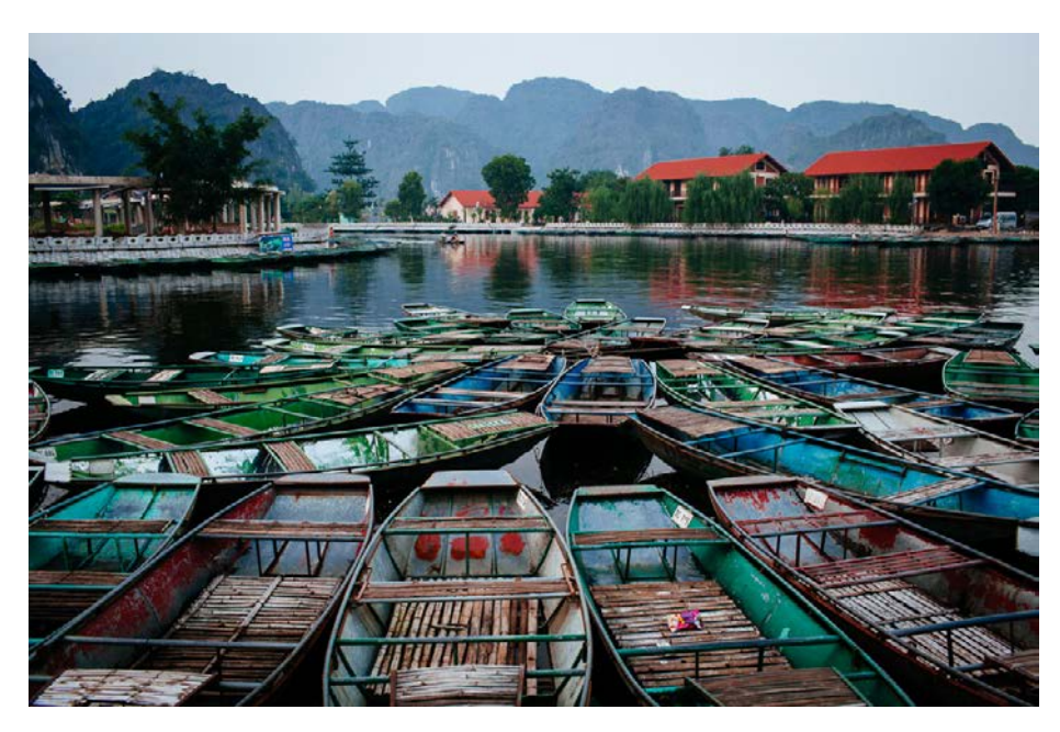
Figure 6.1: Ninh Binh, Vietnam

In the spring of 2020, as countries around the world debated how quickly they could reopen their economies amid the pandemic, Vietnam was ahead of the curve. A national social distancing campaign that shut down non-essential businesses ended on April 22, and life in the country returned to almost normalcy. Restaurants, bars, cinemas, barbers and other shops reopened, and sporting events and festivals were allowed to resume. Almost immediately, the Ministry of Transport started to increase domestic flights and operate trains to major destinations albeit with limited passenger capacity.